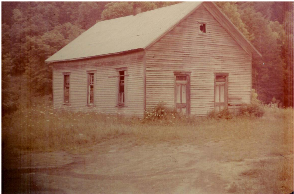
Westview School in Claxton Community (burned in the 1960s) Located behind the Claxton Telephone Exchange Building